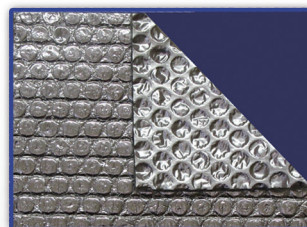
Both sides foil

Tel JHB: 011 462 9122 CT: 021 931 1104 www.alububble.co.za