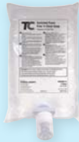
Free 'n Clean Soap