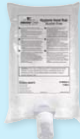
Alcohol-Free Hygienic Hand Rub