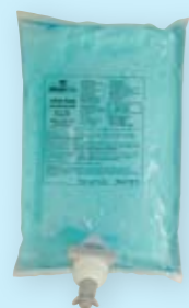
Lotion Soap w/ Moisturizer