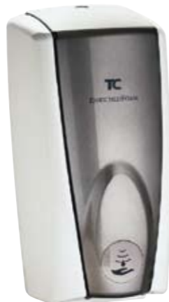
White Pearl Grey