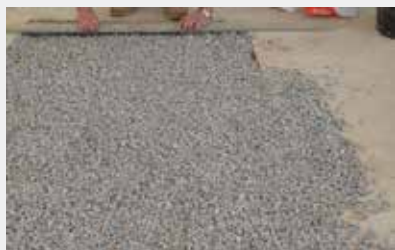
Fig 04: Stone spread in area to be filled

Fill the recess with 6 to 8mm washed stone, creating a level surface to the level of the rods, or wall markings.