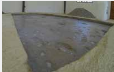
Fig 02: VAPORiTe first coat

If the screed moisture is higher than permitted, apply VAPORiTe water-based epoxy moisture barrier in accordance with the Data Sheet for VAPORiTe , including iTe SILICA into the second coat to promote better adhesion.