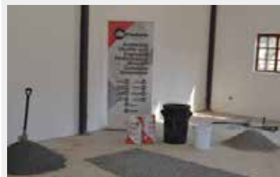
Fig 05: Levelled stone spread