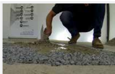
Fig 06: Trolling in LEVELiTe. Bulked up coat.

Maintain the desired level, compacting with a straight edge, so that any aggregate does not protrude excessively.