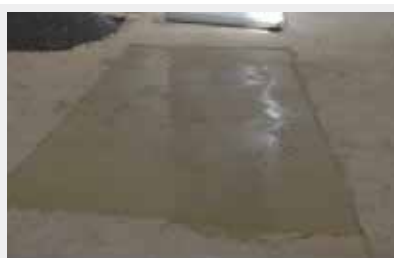
Fig 07: Finished bulked up coat

Repeat this process until the entire recess is filled.