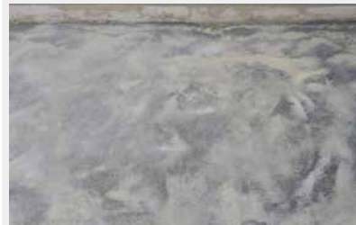
Fig 03: VAPORiTe applied with iTe SILICA

The Bulking-up process entails applying a bulked material layer to build the level up to a point where a second, conventional layer of LEVELiTe is added to achieve the final thickness allowing for the thickness of the floor covering to be installed.