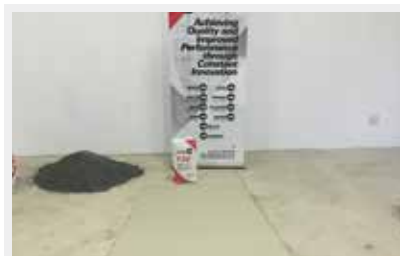
Fig 09: Final LEVELiTe coat