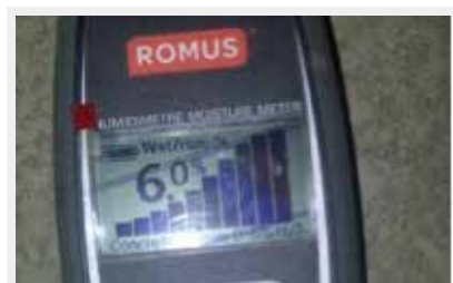
Fig 01: Moisture Testing

Determine Screed Moisture Levels – Measure the screed moisture levels using appropriate, reliable test equipment to check that the moisture levels are below the tolerances of the floor covering to be installed. (SANS 10070 code of practice stipulates that if the screed moisture exceeds 3% moisture content (70% RH), then a moisture primer (barrier) should be applied).