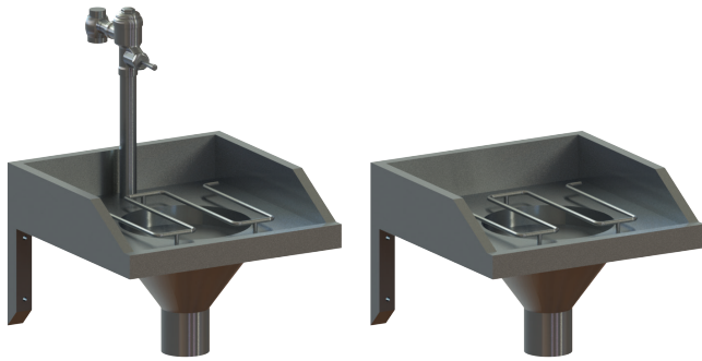
Slop Hopper (Model SH)