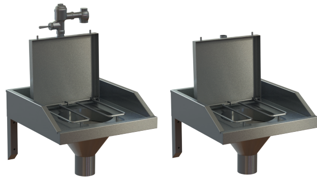
Slop Hopper with lid (Model SHL)