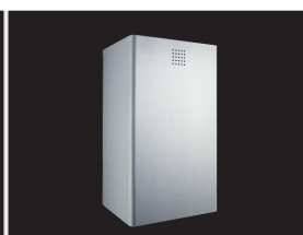
waste bin PU-200