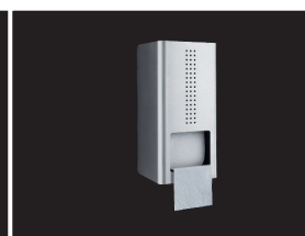
double toilet roll holder PU-300