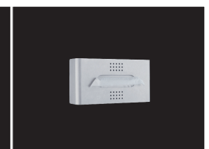
tissue dispenser PU-390