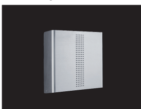
paper towel dispenser PU-100