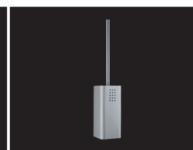
toilet brush holder PU-500