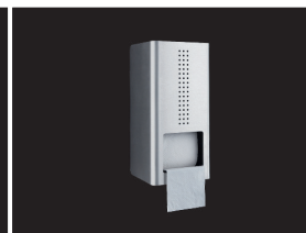
double toilet roll holder PU-300