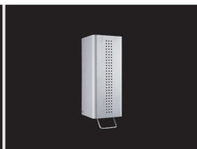
soap dispenser PU-140