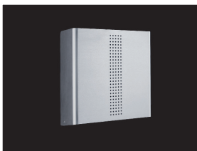
paper towel dispenser PU-100