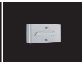
tissue dispenser PU-190