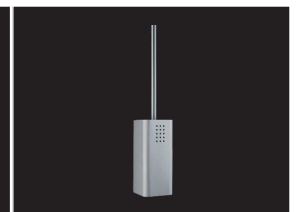
toilet brush holder PU-500