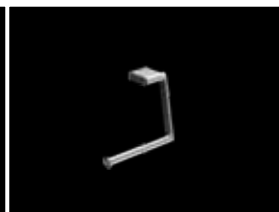
single toilet roll holder PU-380