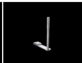
spare roll holder PU-390