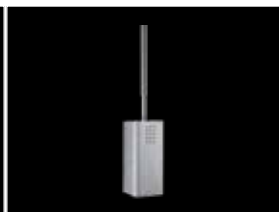
toilet brush holder PU-500