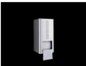
double toilet roll holder PU-300