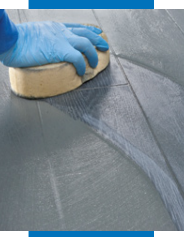
Cleaning and finishing the joints with a hard cellulose sponge

the micro-structure of the joints, block the formation of micro-organisms that cause mould damage.