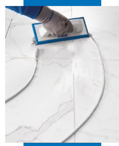
Spreading Ultracolor Plus on marble-effect porcelain floor tiles with a rubber float