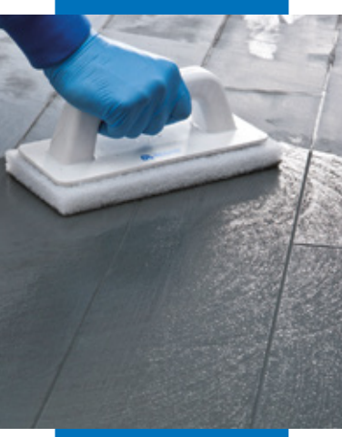
Cleaning the joints with a Scotch-Brite® pad (when the product is semi hardened)