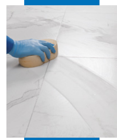
Cleaning and finishing the joints with a hard cellulose sponge