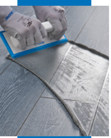
Spreading Ultracolor Plus on wood-effect porcelain floor tiles with a rubber float