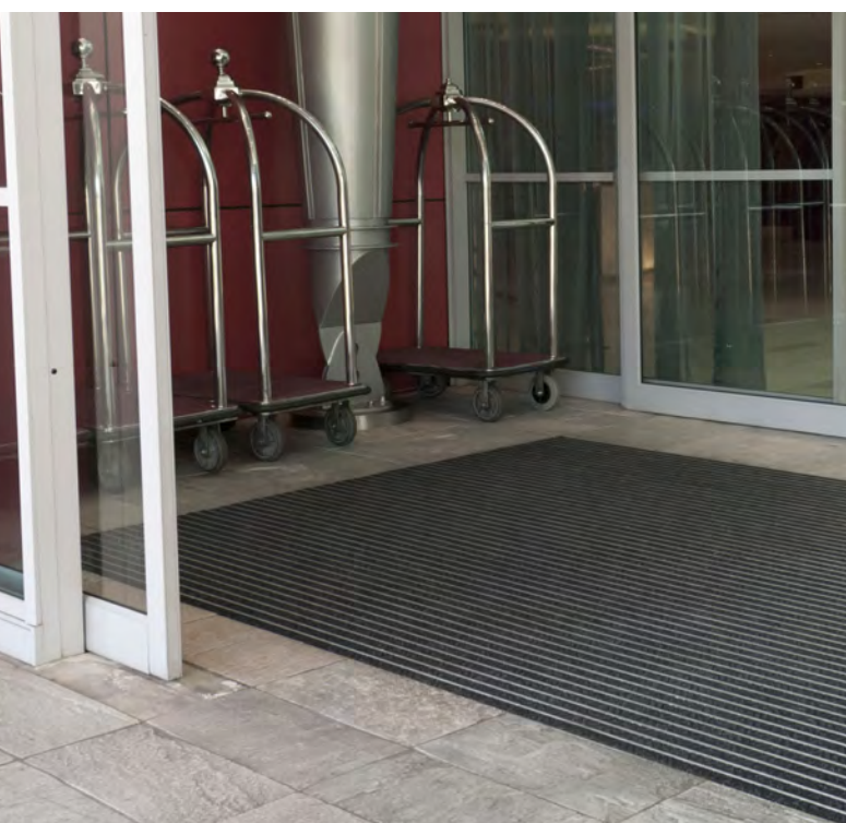
Berber Point Insert