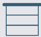
RTS roman blinds