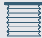
RTS cellular shades