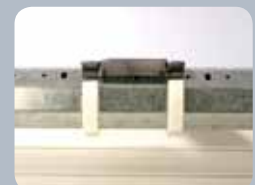
Fix the rings