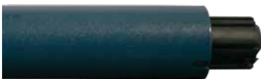
For 425 mm minimum roller shutters.