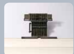
Slip the link onto the curtain