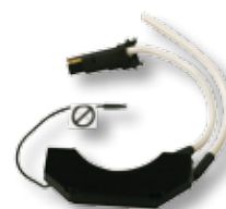
Oximo RTS module

FOR ALL TYPES OF NARROW ROLLER SHUTTERS, FITTED WITH RIGID LINKS AND STOPPERS