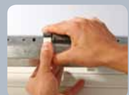
Clip the rings