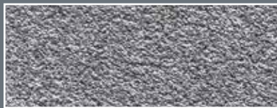
DARK GREY 96