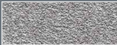
LIGHT GREY 93