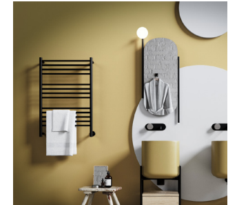
Jeeves Heated Towel Rails