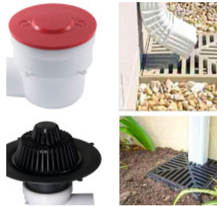
Drainage - Seaqual