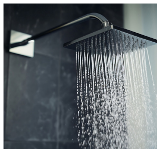
Shower & Bath Accessories