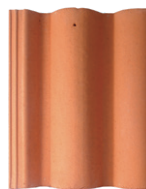
Through Colour Terracotta

Our vivid tiles have an enriched body colour without the addition of a coating. Available in all standard colours shown.