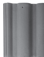
Through Colour Slate Grey