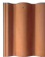
Through Colour Brown