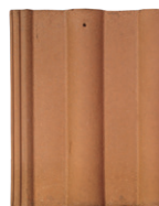
Through Colour Brown