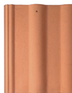
Through Colour Terracotta

Our vivid tiles have an enriched body colour without the addition of a coating. Available in all standard colours shown.