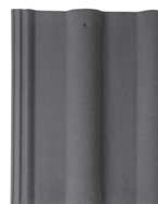
Through Colour Slate Grey