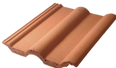
Through Colour Terracotta

Our Double Roman roof tile is a classic for the subtle and timeless design.