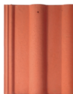
Through Colour Red