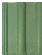
Classic Moreland Green