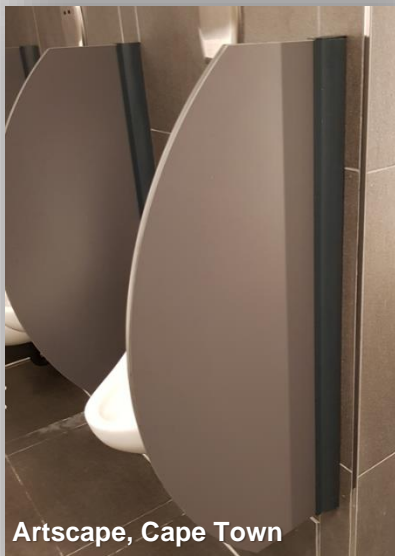
Artscape, Cape Town