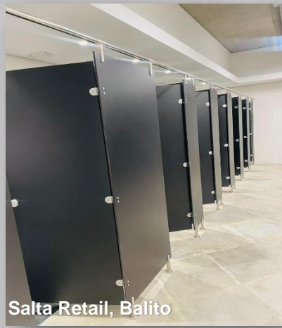
Salta Retail, Balito