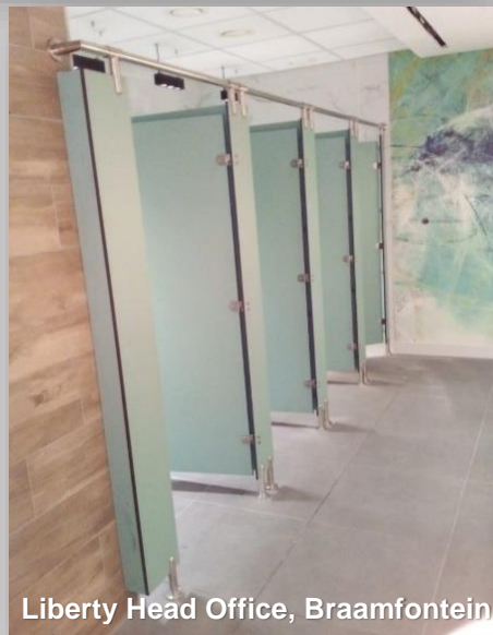
Liberty Head Office, Braamfontein