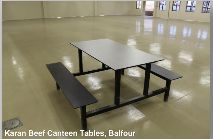
Karan Beef Canteen Tables, Balfour