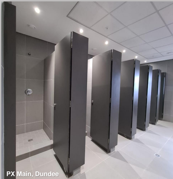
PX Main, Dundee