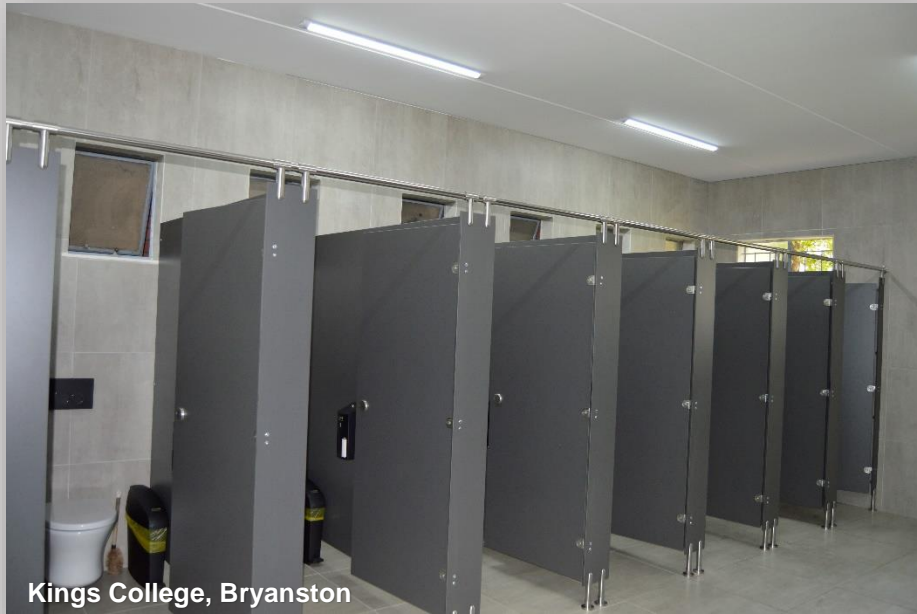
Kings College, Bryanston