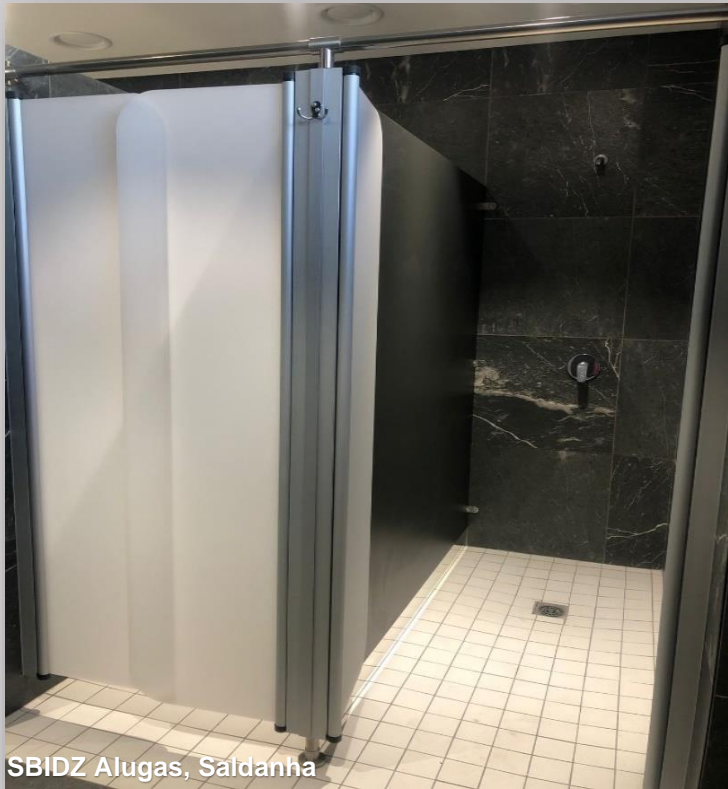
SBIDZ Alugas, Saldanha

IN COMPACT HIGH PRESSURE LAMINATE (CHPL) OR CAST ACRYLIC PERSPEX (CAP)