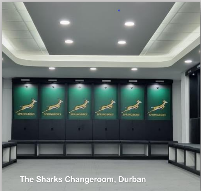
The Sharks Changeroom, Durban