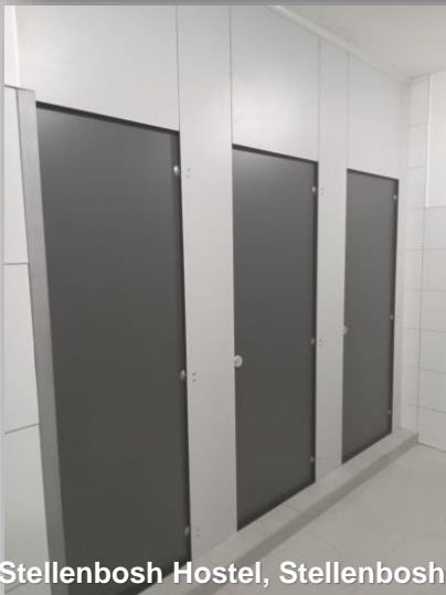
Stellenbosh Hostel, Stellenbosh