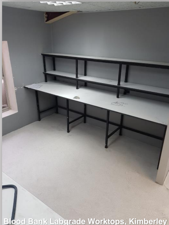
Blood Bank Labgrade Worktops, Kimberley