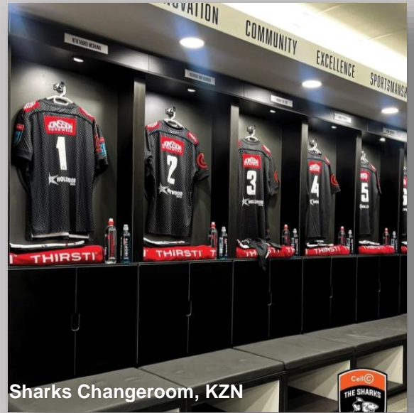
Sharks Changeroom, KZN