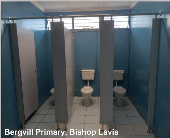
Bergvill Primary, Bishop Lavis