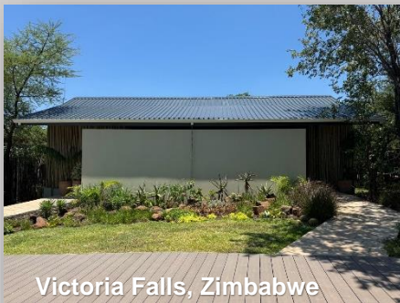
Victoria Falls, Zimbabwe