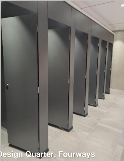
Design Quarter, Fourways