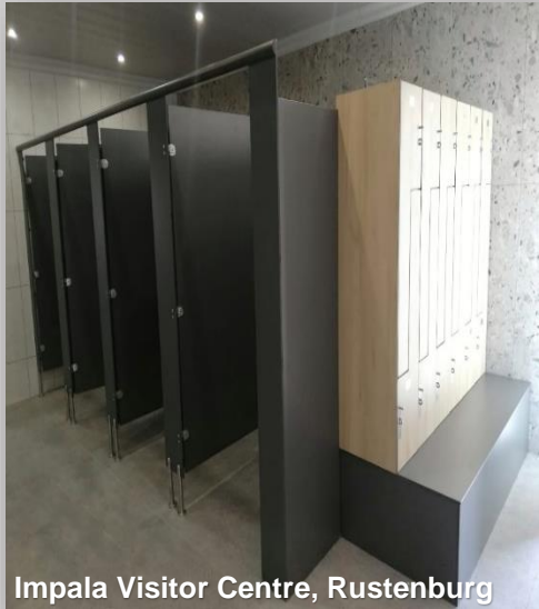
Impala Visitor Centre, Rustenburg

IN CUBE STANDARD RANGE WITH STAINLESS STEEL