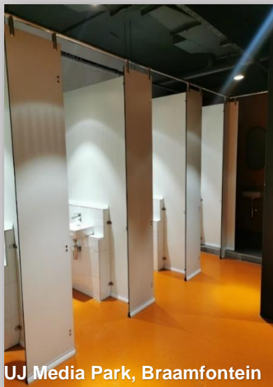
UJ Media Park, Braamfontein