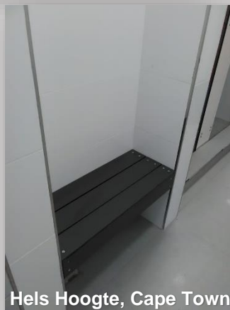
Hels Hoogte, Cape Town