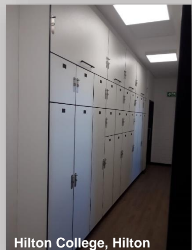
Hilton College, Hilton