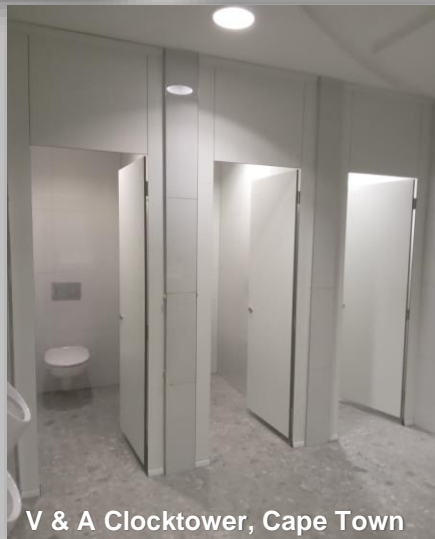
V & A Clocktower, Cape Town