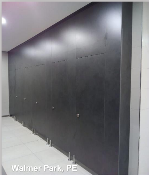
Walmer Park, PE