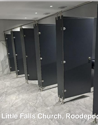
Little Falls Church, Roodepoort