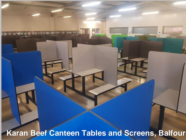
Karan Beef Canteen Tables and Screens, Balfour