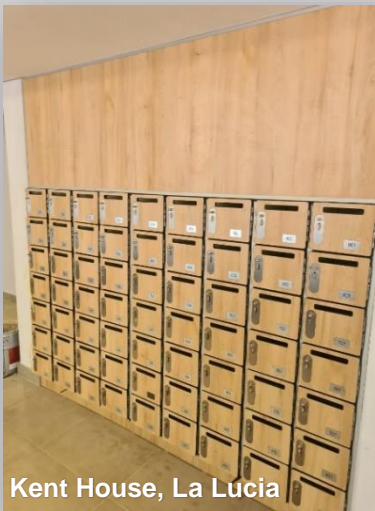
Kent House, La Lucia