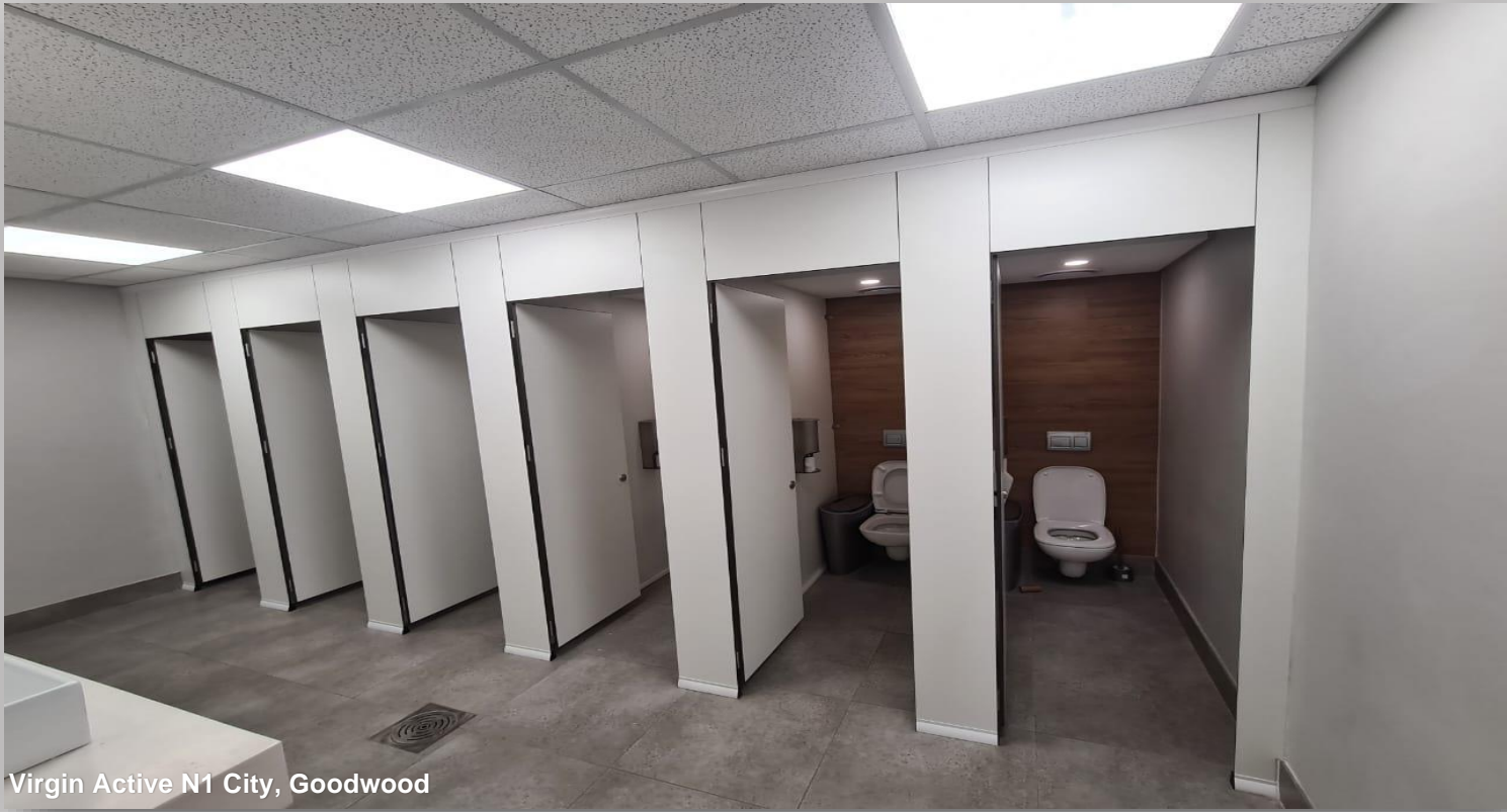
Virgin Active N1 City, Goodwood