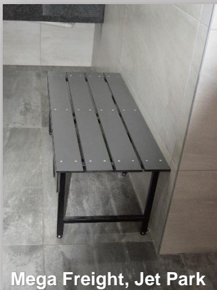
Mega Freight, Jet Park