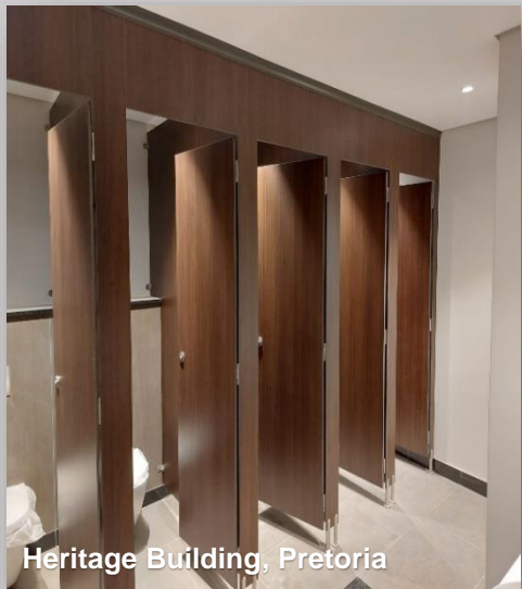
Heritage Building, Pretoria