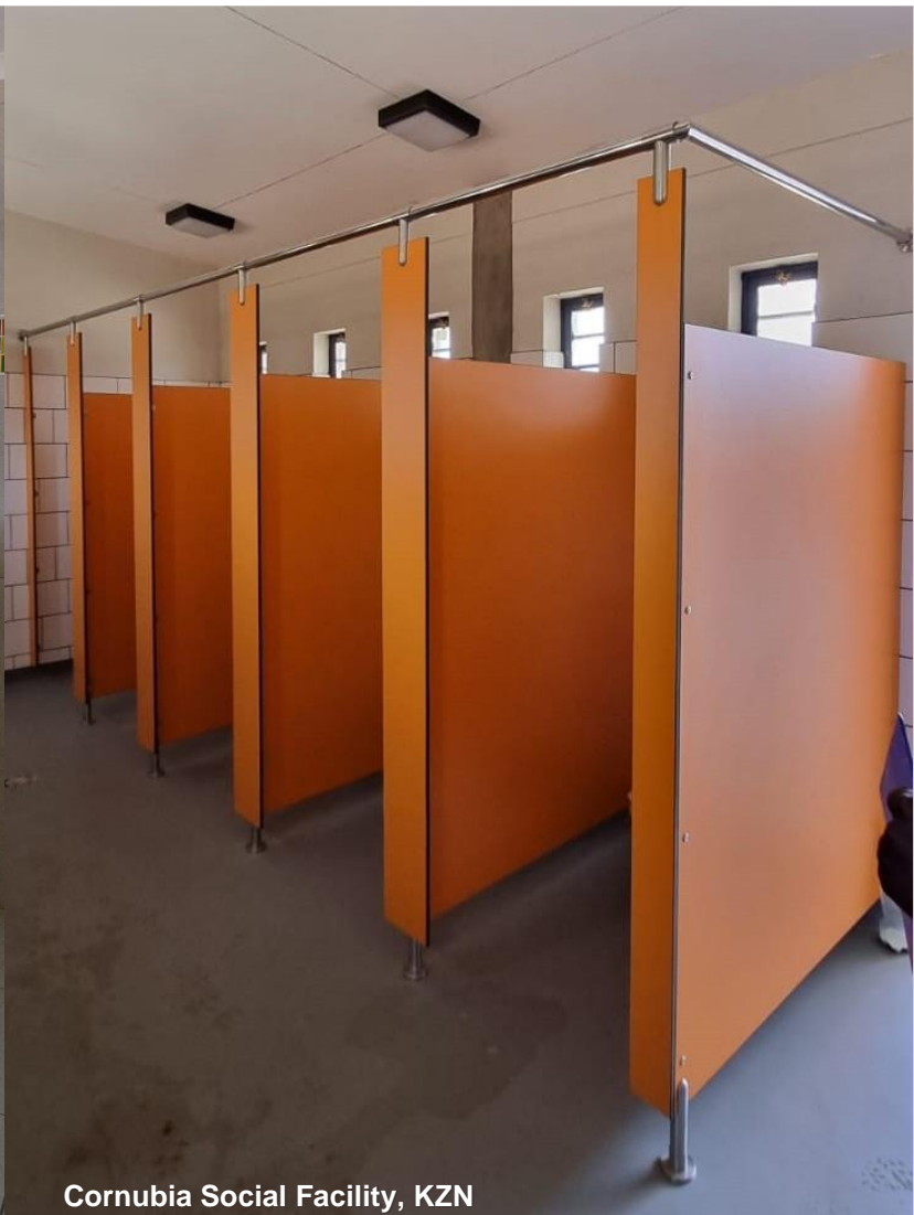
Cornubia Social Facility, KZN