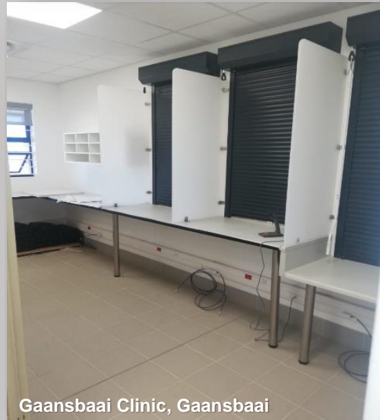
Gaansbaai Clinic, Gaansbaai