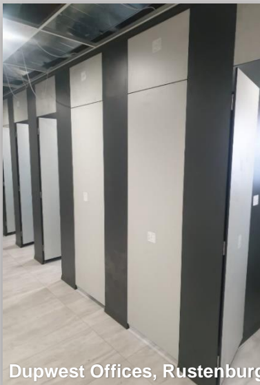
Dupwest Offices, Rustenburg