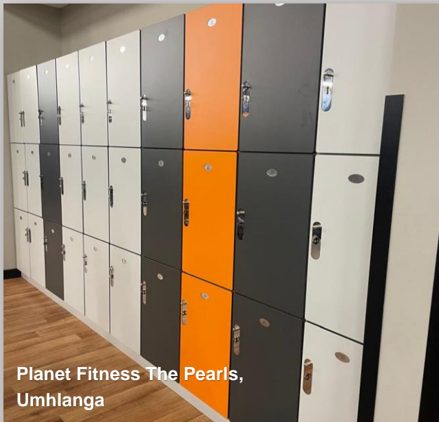
Planet Fitness The Pearls, Umhlanga