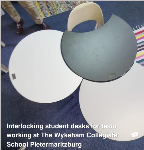
Interlocking student desks for team working at The Wykeham Collegiate School Pietermaritzburg