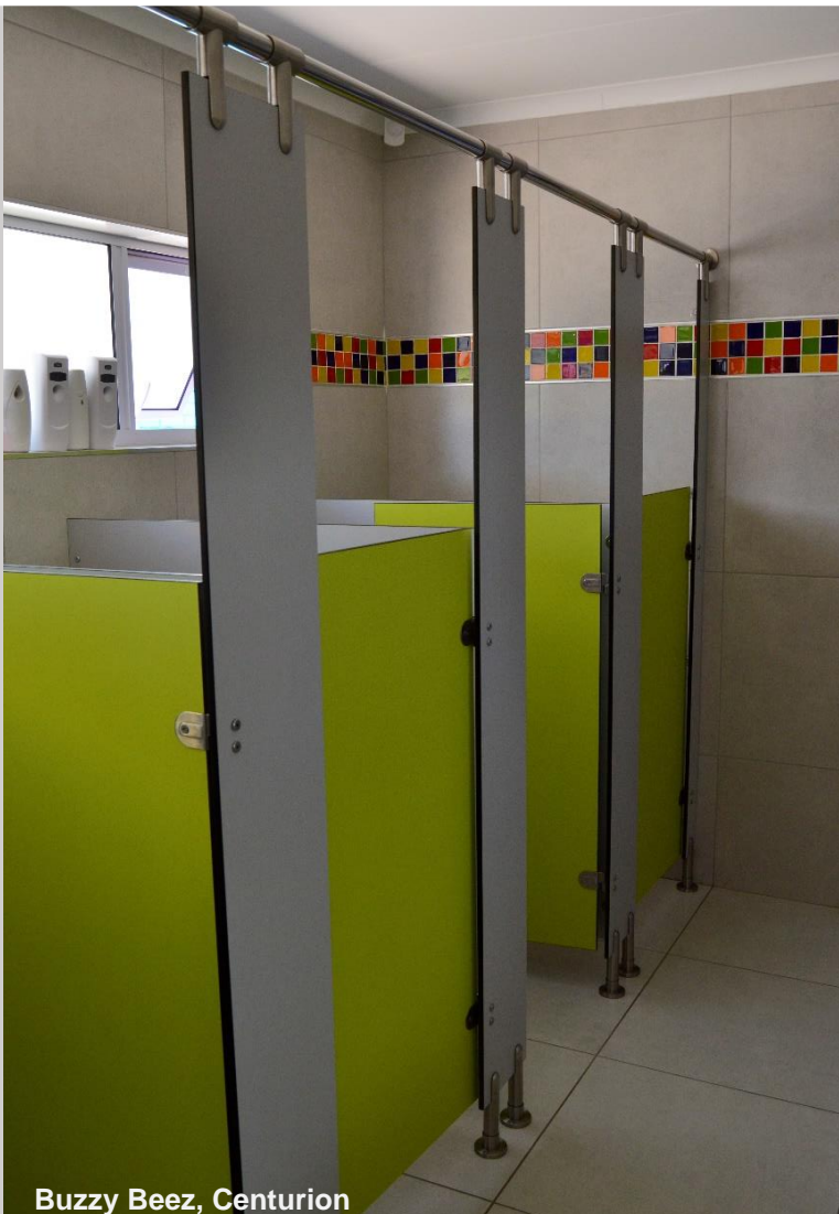
Buzzy Beez, Centurion