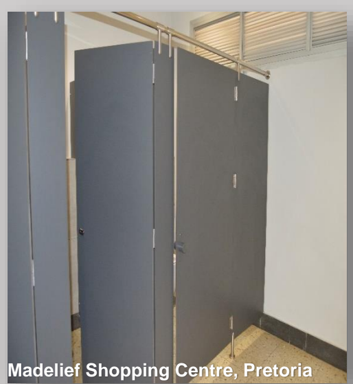
Madelief Shopping Centre, Pretoria