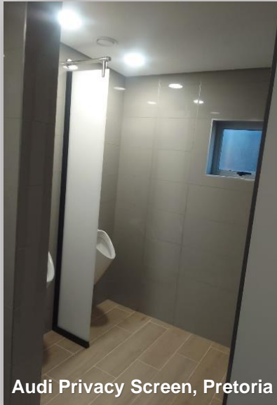
Audi Privacy Screen, Pretoria

IN COMPACT HIGH PRESSURE LAMINATE (CHPL) OR CAST ACRYLIC PERSPEX (CAP)