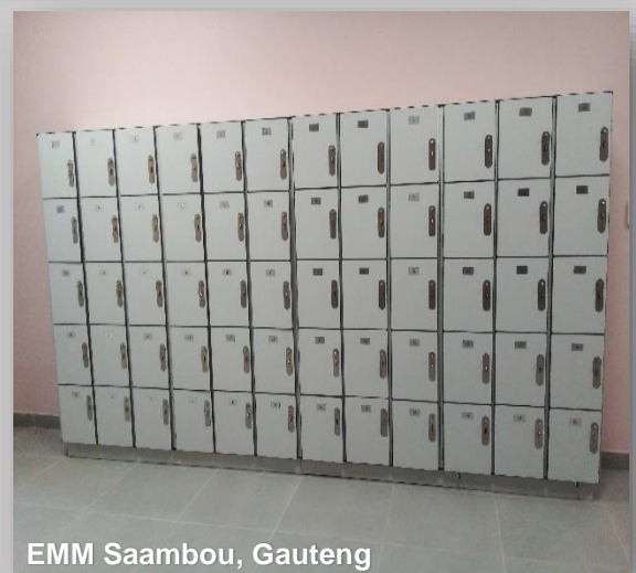
EMM Saambou, Gauteng