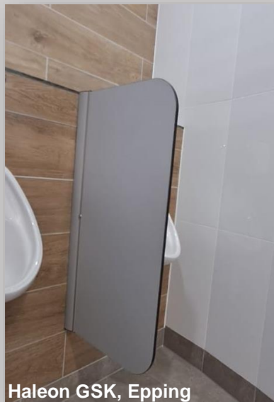
Haleon GSK, Epping