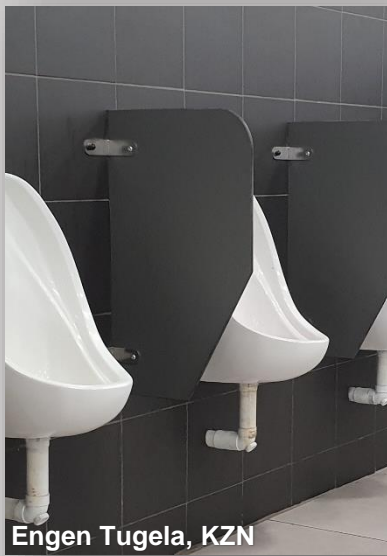
Engen Tugela, KZN