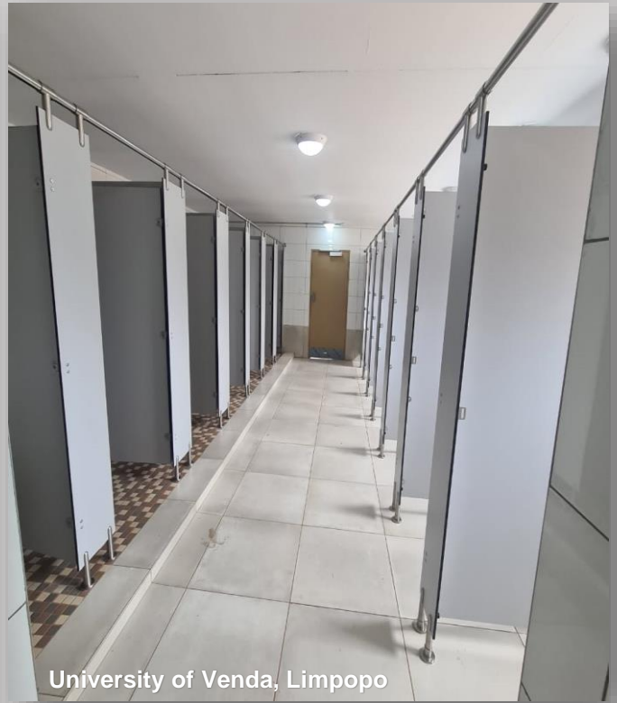
University of Venda, Limpopo