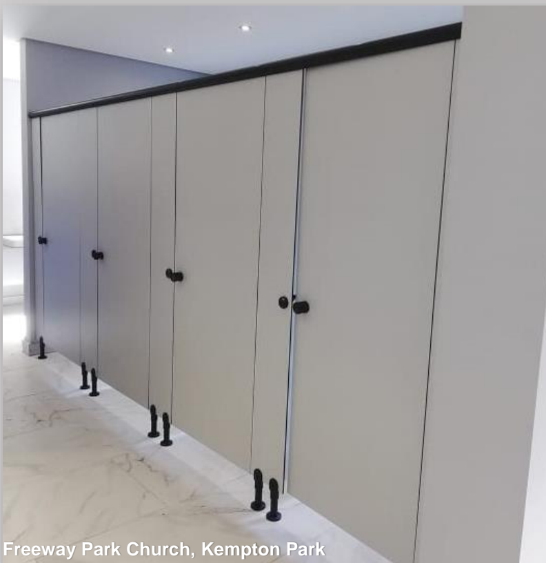
Freeway Park Church, Kempton Park

IN CUBE STANDARD RANGE WITH NYLON PLASTIC IRONMONGERY