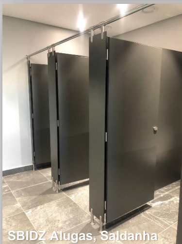
SBIDZ Alugas, Saldanha