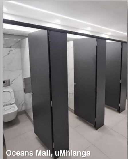
Oceans Mall, uMhlanga