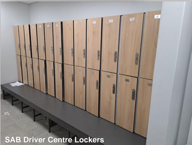
SAB Driver Centre Lockers