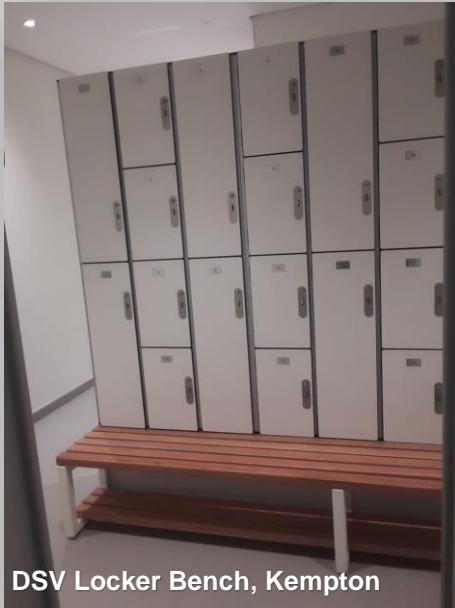
DSV Locker Bench, Kempton

IN COMPACT HIGH PRESSURE LAMINATE (CHPL)