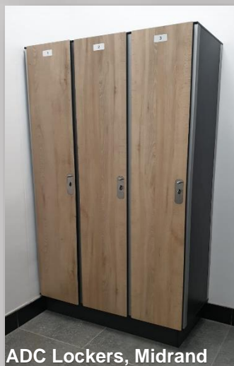
ADC Lockers, Midrand