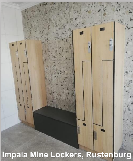
Impala Mine Lockers, Rustenburg