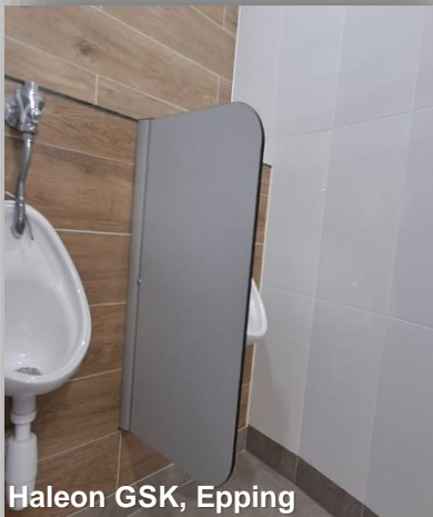
Haleon GSK, Epping

Cubicle Solutions combine design flexibility with affordable costs by providing tailor-made cubicle systems for toilet, shower and change room applications. This is a modular system which is floor anchored with an overhead brace. It is extremely robust and hard wearing and most often used in commercial offices, public buildings, shopping malls, hospitals and sporting facilities. This application can be manufactured using various board types, as follows: