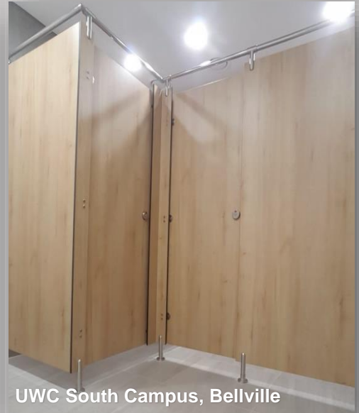
UWC South Campus, Bellville