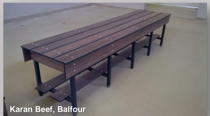
Karan Beef, Balfour