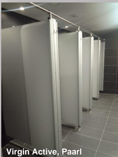
Virgin Active, Paarl