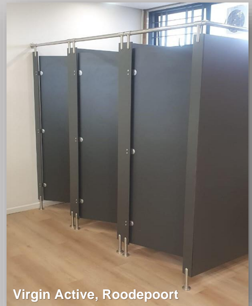
Virgin Active, Roodepoort