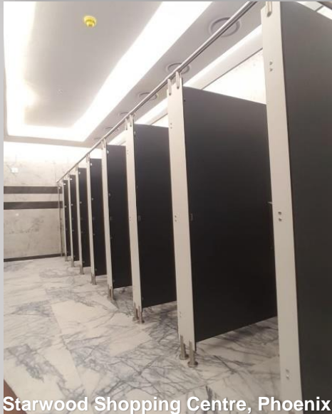
Starwood Shopping Centre, Phoenix