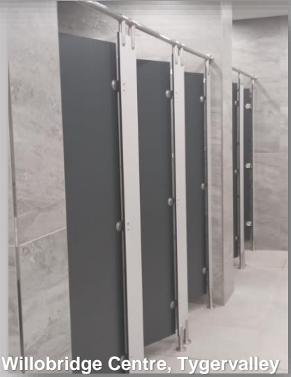
Willobridge Centre, Tygervalley