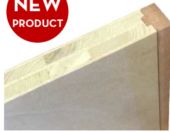
Detail section showing Mixed Timber Core

Door Description: PD652 is a Solid Laminated Mixed Timber Flush Door, consisting of Hardwood Face Veneers, Hardwood Concealed Edges and a Mixed Timber core.